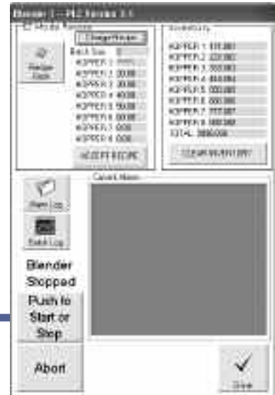
A3 Virtual Control Panel