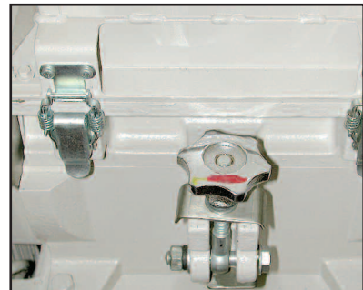
"Tool free" opening for quick access during cleaning