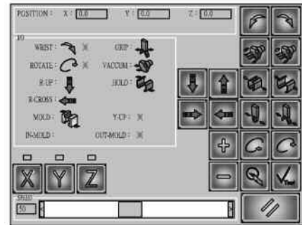
Manual Mode Operation