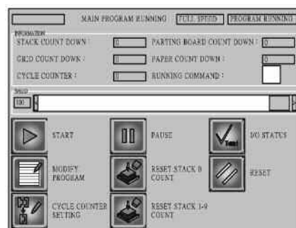
Main Program Screen