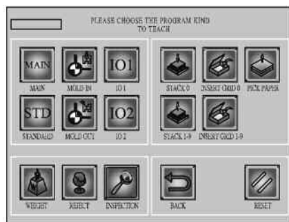
Program Teach Screen