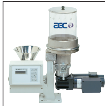
DD 1 Feed Rate: 0.2-800 lbs/hr Operating Load: 0.2 kW Weight: 51lbs (23kg)