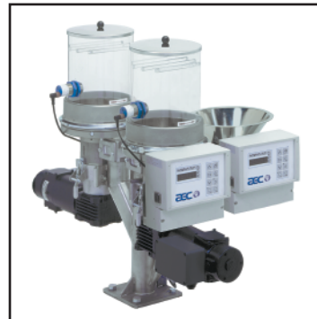
DD 2 Feed Rate: 0.2-800 lbs/hr Operating Load: 0.4 kW Weight: 100lbs (45kg)