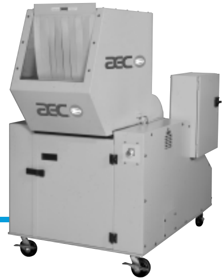
GP1200 Premier Series Granulator

The GP1200 Premier Series granulators offer a wide range of capabilities to handle the most demanding injection molding, blow molding and extrusion requirements. With a horsepower range from 7 1/2 to 25 HP, throughput capacities from 500 to 800 lbs./hr, and a wide range of sizes, there is a AEC granulator ideal for your specific needs. The 3-knife open slant-cut rotor with scooped wings provides for both positive feeding of bulky parts and improved airflow for cooler operation.