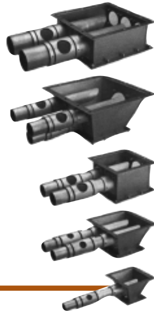
MTO Modular Take-Off Boxes

MTO take-off boxes are available in single or multiple lines with styles including complete clean-out type with tapered bottom, or box type, which provides various material line take-off configurations. All compartments have adjustable tubes for air/material balancing.