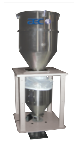
GH Series Weigh Hopper