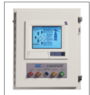
CoExpert™ Extrusion Control System